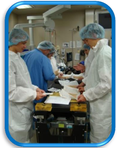
Sanford YME meeting in Sanford Surgical Tower

Sanford Health is privileged to sponsor our own Sanford Health HOSA chapter through our Sanford Youth Medical Explorers program. Sanford Health provides students the opportunity to participate in HOSA activities, conferences and scholarships. HOSA is an international student organization recognized by the U.S. Department of Education and the Health Science Education (HSE) Division of ACTE. The Sanford YME program allows students to explore healthcare roles through tours and conversations with healthcare providers in the departments of the Sanford Medical Center in Sioux Falls. See link for application and information: http://www.sanfordhealth.org/Careers/InternshipsJobShadowingAndResidency/HighSchoolStudentOpportunities